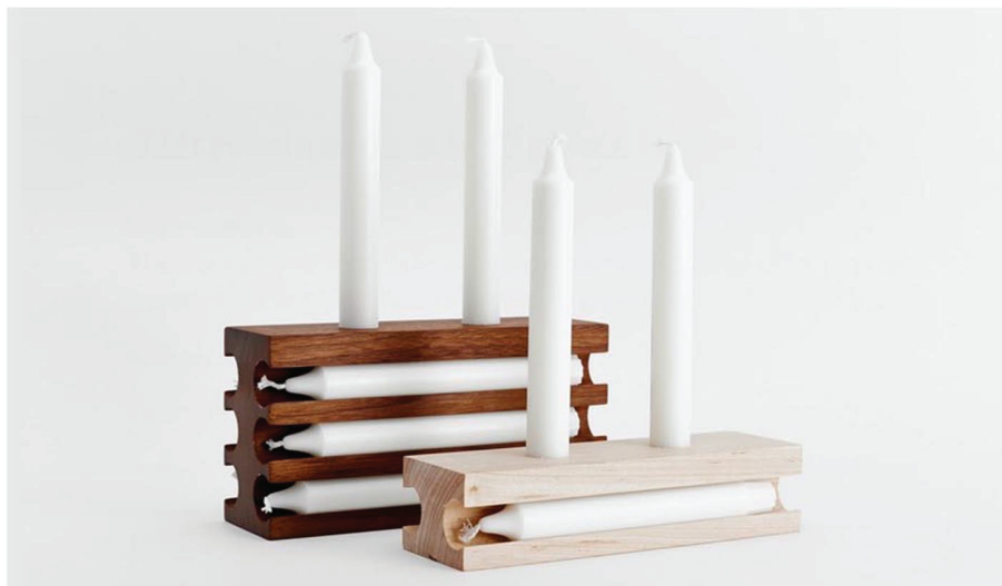
Loaded, by MNR 8, comes with backup candles that can be stored in its slotted sides.

23 days ago Tags: Exhibition, Product Design